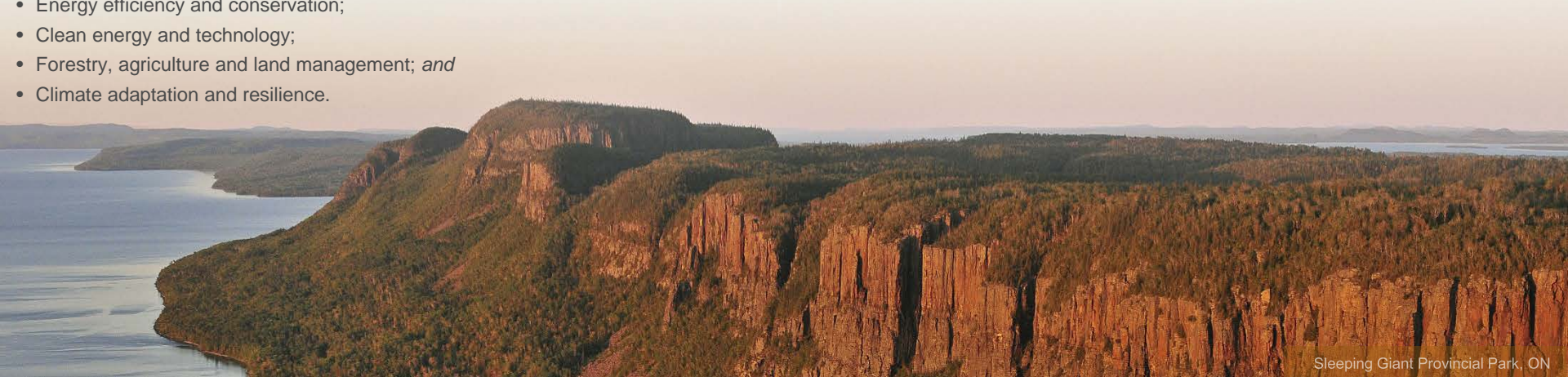
Sleeping Giant Provincial Park, ON

The Province is planning for its fourth Green Bond issuance before the end of fiscal 2017–18.